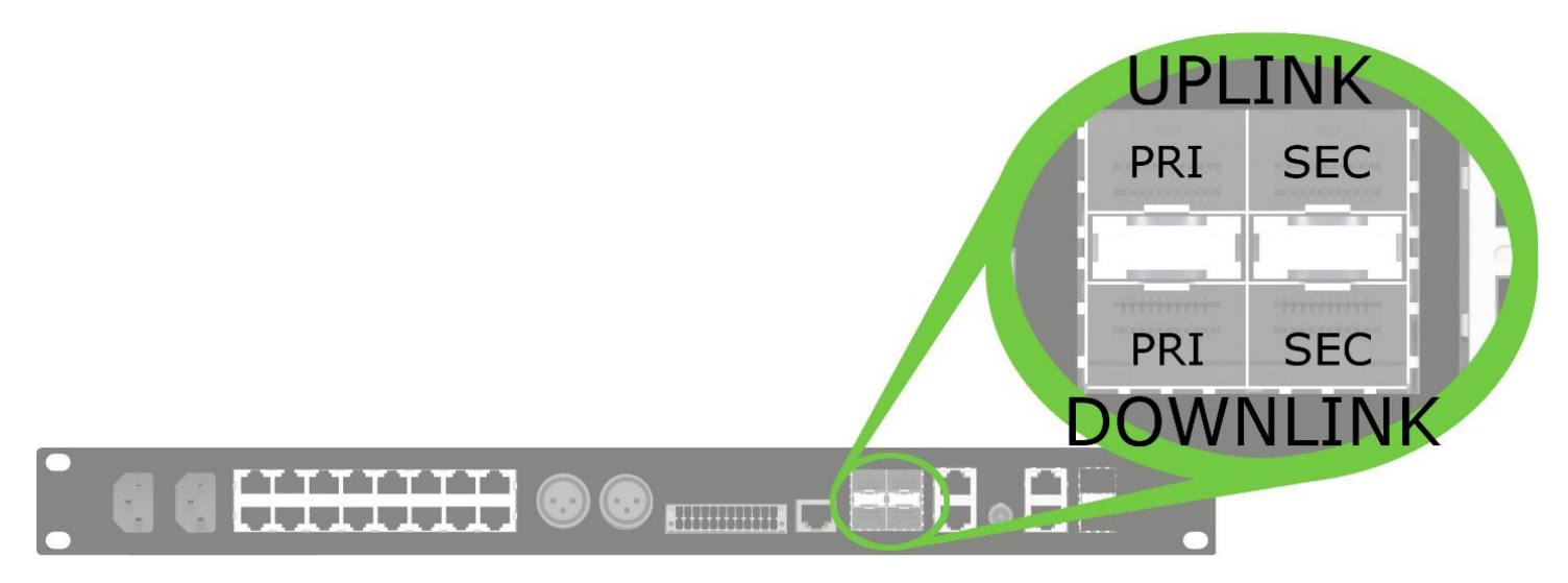
Figure 2. The rear of ODIN has the IFL connectors

The IFL is located on the rear of the unit, as shown Figure 2. The IFL consists of four "cages", where the SFPs are inserted. Note ODIN does not ship with SFPs. They must be ordered separately.