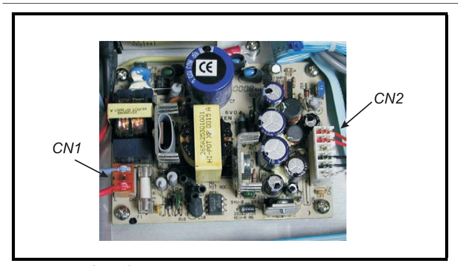
FIGURE 1. Old Power Supply

3. Remove the four (4) placement screws and remove the power supply. Set the four screws aside, they will be used to remount the new power supply.