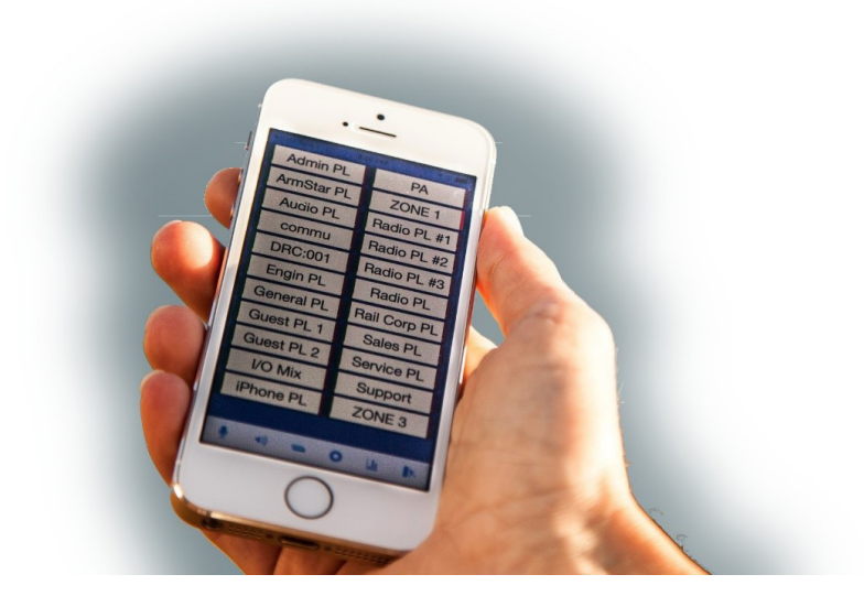
Figure 1. Matrix access on your smartphone

VLINK is the name of a product from RTS that provides matrix access from smartphones or connected laptops. With the VLINK app installed on a smartphone, it is possible to communicate with other users on the matrix system. The smartphone behaves like a portable keypanel. This is illustrated in Figure 1.