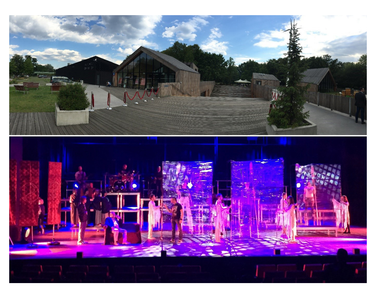
Figure 2. House of Culture in Poland - exterior view (top) and rehearsal of a theater production (bottom)

Finally, a separate GPIO-16 general purpose input/output device is used for a couple of customized functions. First, relay outputs from the GPIO-16 control the Silence transparents (lamps). Second, there is a custom wall box in the Actors' room. It has a set of backlit push buttons which can be used both to send indications, as well as allow actors to provide an acknowledgment (for example get ready to go on stage). The GPIO-16 communicates with the matrix through an RS-485 serial data connection. The keypanels are programmed to allow Director or Stage Manager to send signals to the Actors' room by actuating keys on their panel.