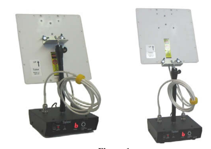
Figure 1 XO-AP and Panel Antenna