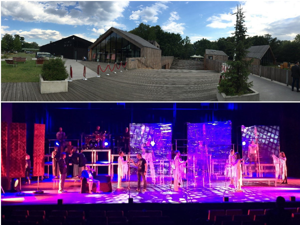
Figure 2. House of Culture in Poland - exterior view (top) and rehearsal of a theater production (bottom)

Finally, a separate GPIO-16 general purpose input/output device is used for a couple of customized functions. First, relay outputs from the GPIO-16 control the Silence transparents (lamps). Second, there is a custom wall box in the Actors' room. It has a set of backlit push buttons which can be used both to send indications, as well as allow actors to provide an acknowledgment (for example get ready to go on stage). The GPIO-16 communicates with the matrix through an RS-485 serial data connection. The keypanels are programmed to allow Director or Stage Manager to send signals to the Actors' room by actuating keys on their panel.